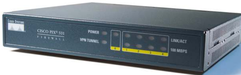
Cisco PIX 501 Security Appliance